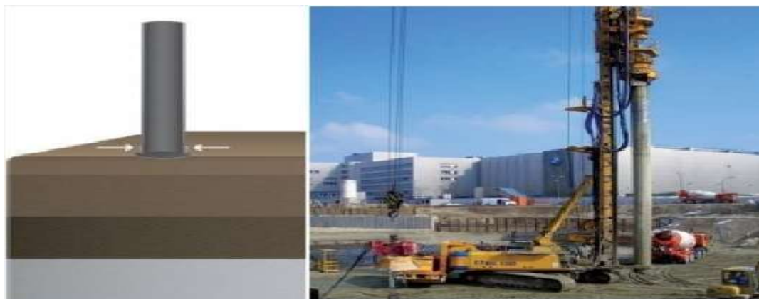
Fig.1: showing boring of cast in situ piles.